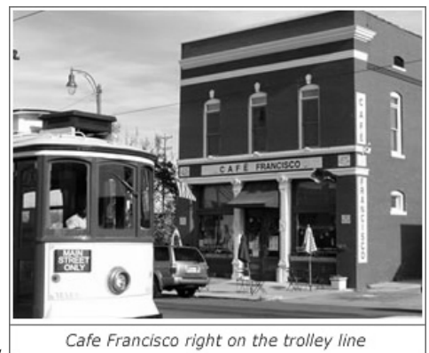
Cafe Francisco right on the trolley line

Now who says there is nothing going on in Downtown Memphis?? So let's get out and enjoy why we chose live so close to the heart of all the action!